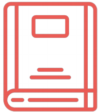
Practitioner's guide for recognition of e-learning

To be able to make an informed recognition decision within reasonable time limits, the project proposes a procedure based on seven criteria: