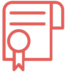
Academic recognition of e-learning